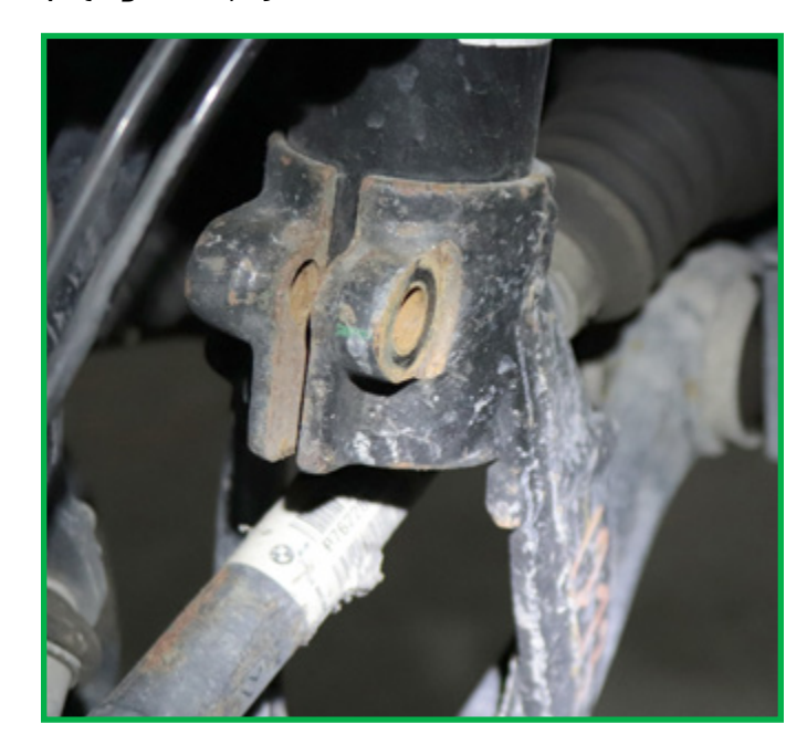
FIGURE 8 FIGURE 9

6. Remove the lower strut mount bolt at the lower spring arm. (Figure 10)