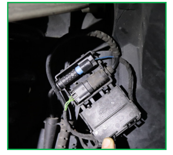
FIGURE 27 FIGURE 28