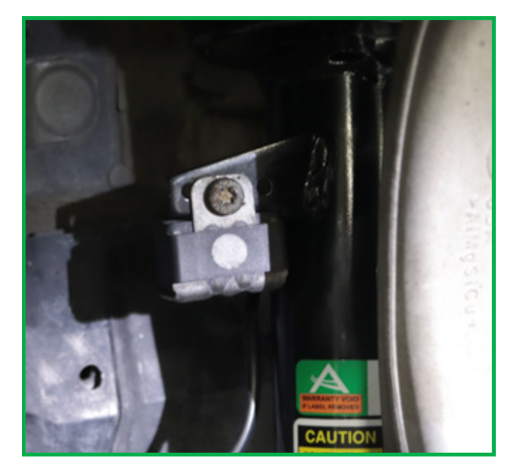
FIGURE 25 FIGURE 26

8. Connect the strut's wire harness to the vehicle. (Figures 27, 28)