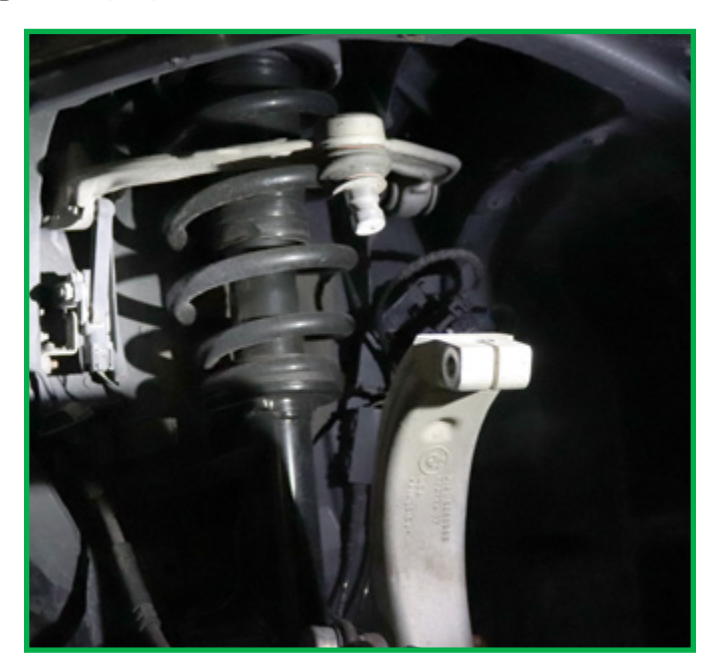
FIGURE 11 FIGURE 12

8. Use an appropriate tool to spread the tube clamp and separate the strut from the lower mount. (Figure 13)