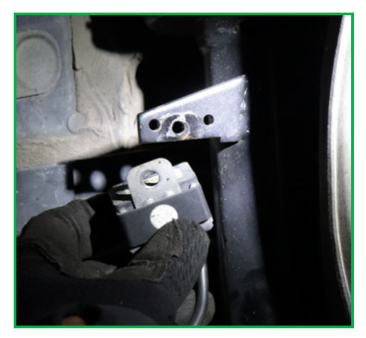
FIGURE 4 FIGURE 5

4. Un-route the wires from the brackets on the strut body. (Figures 6, 7)