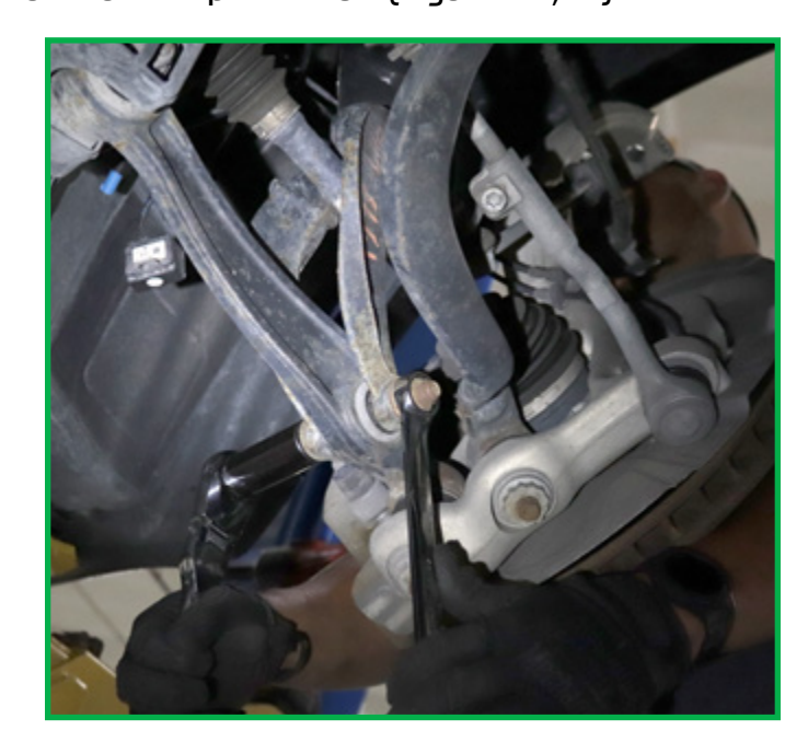
FIGURE 22 FIGURE 23

6. Tighten the top mount nuts to manufacturer's specification. (Figure 24)