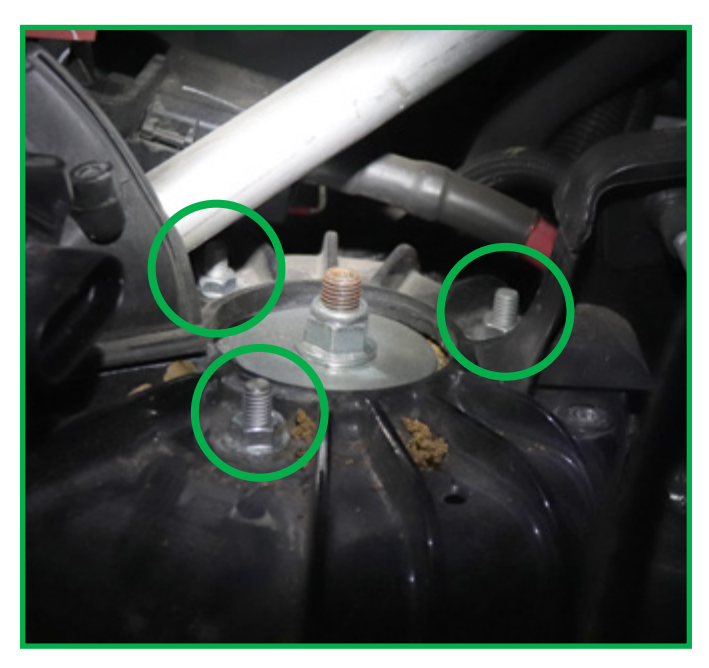
FIGURE 14 FIGURE 15